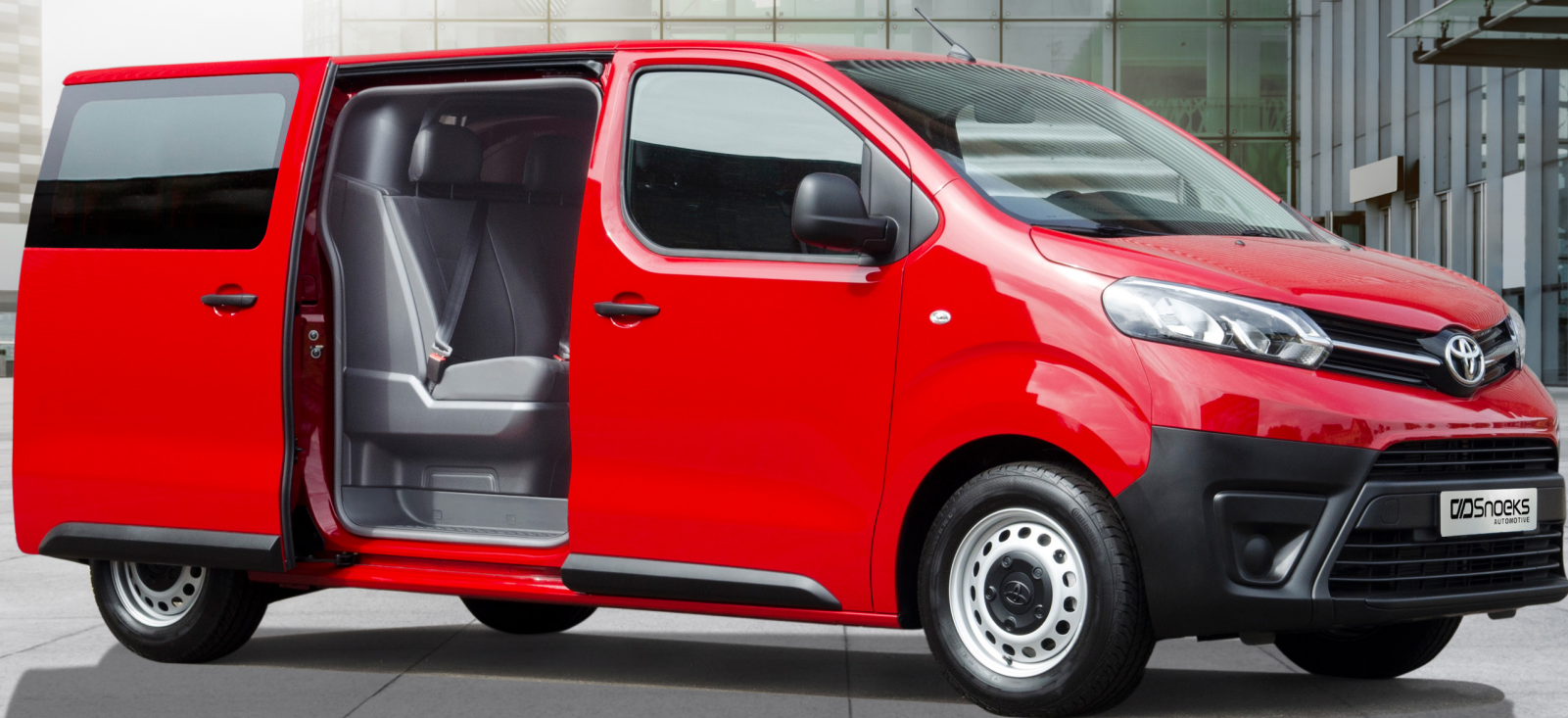
TOYOTA PROACE Crew Cab