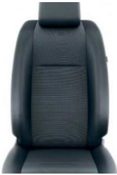
Dark grey with PVC