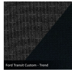
LEADER / TREND