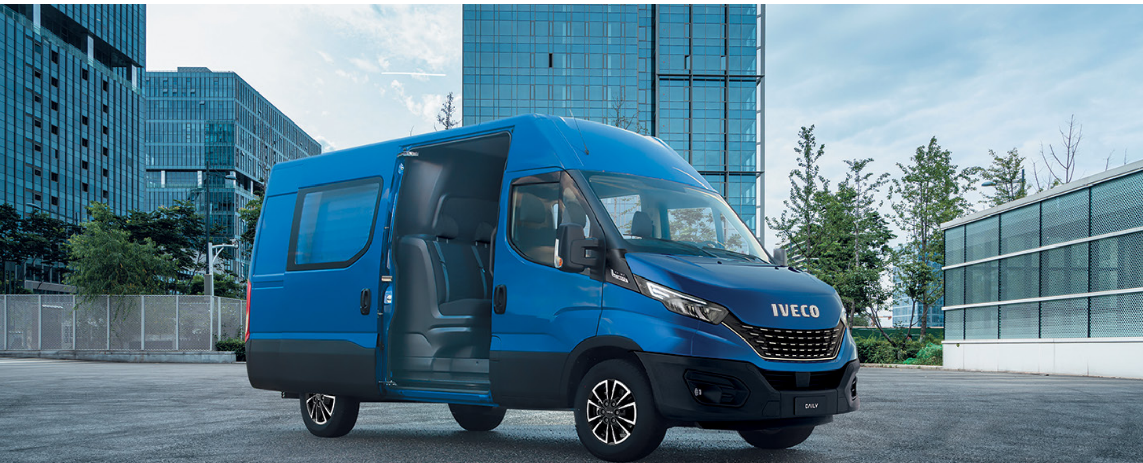
IVECO DAILY Crew Cab