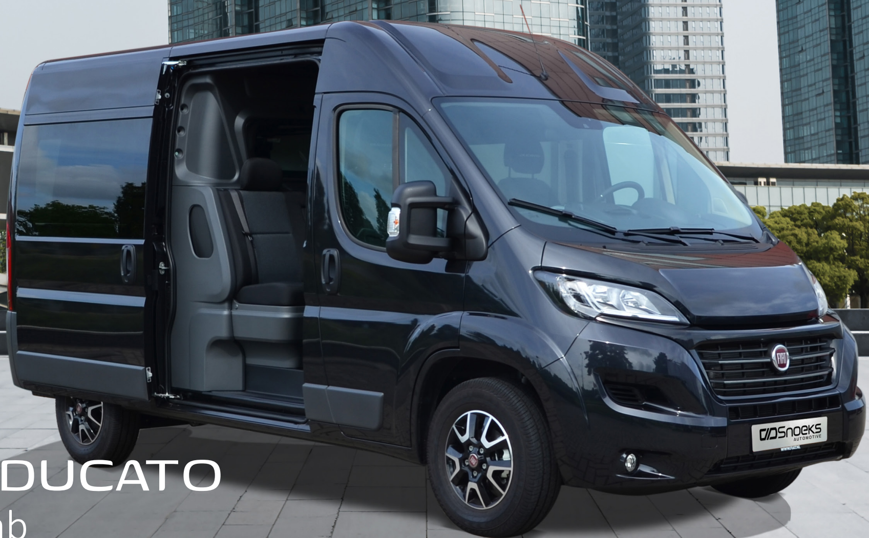
FIAT DUCATO Crew Cab