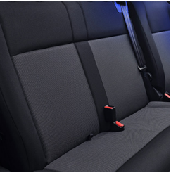
Dark Grey Fabric