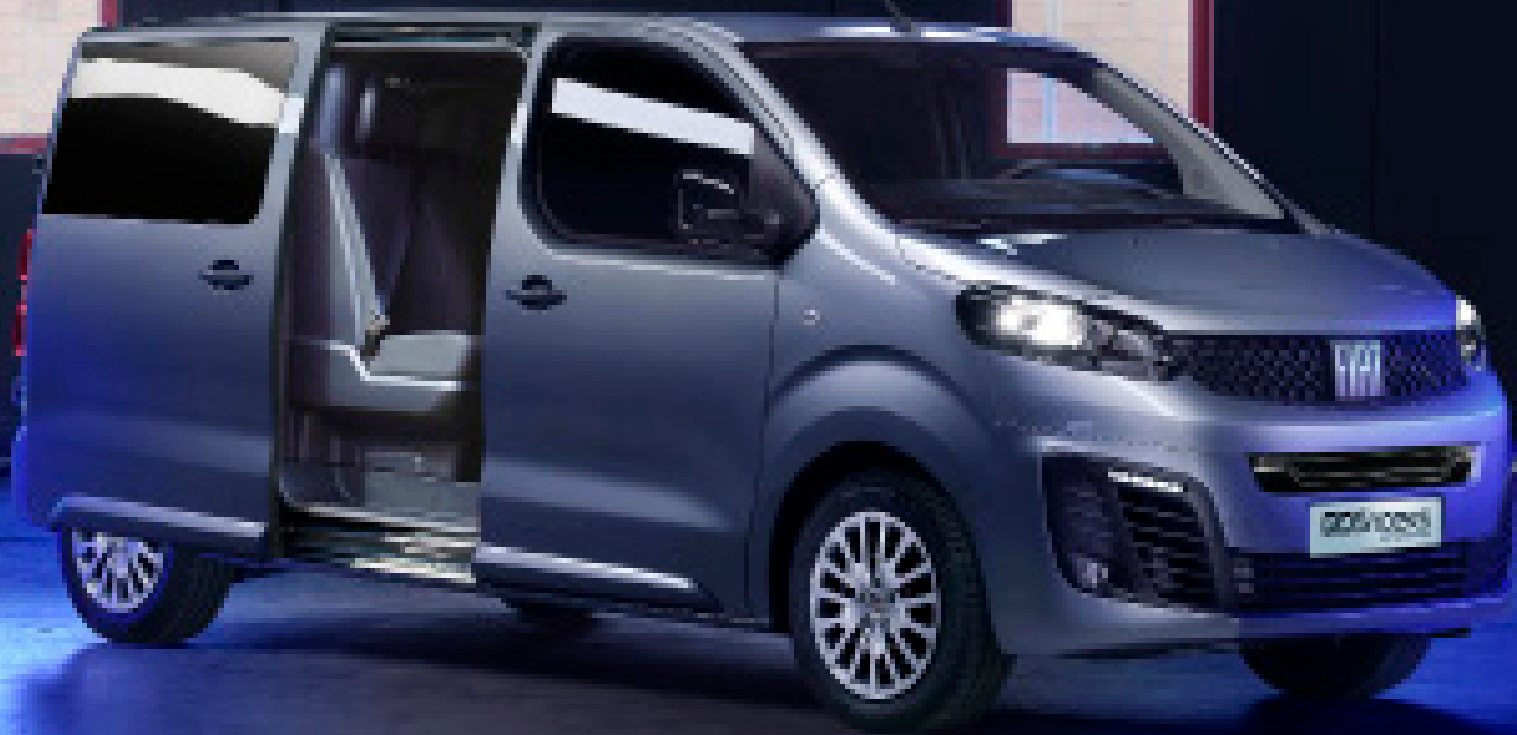
FIAT SCUDO Crew Cab