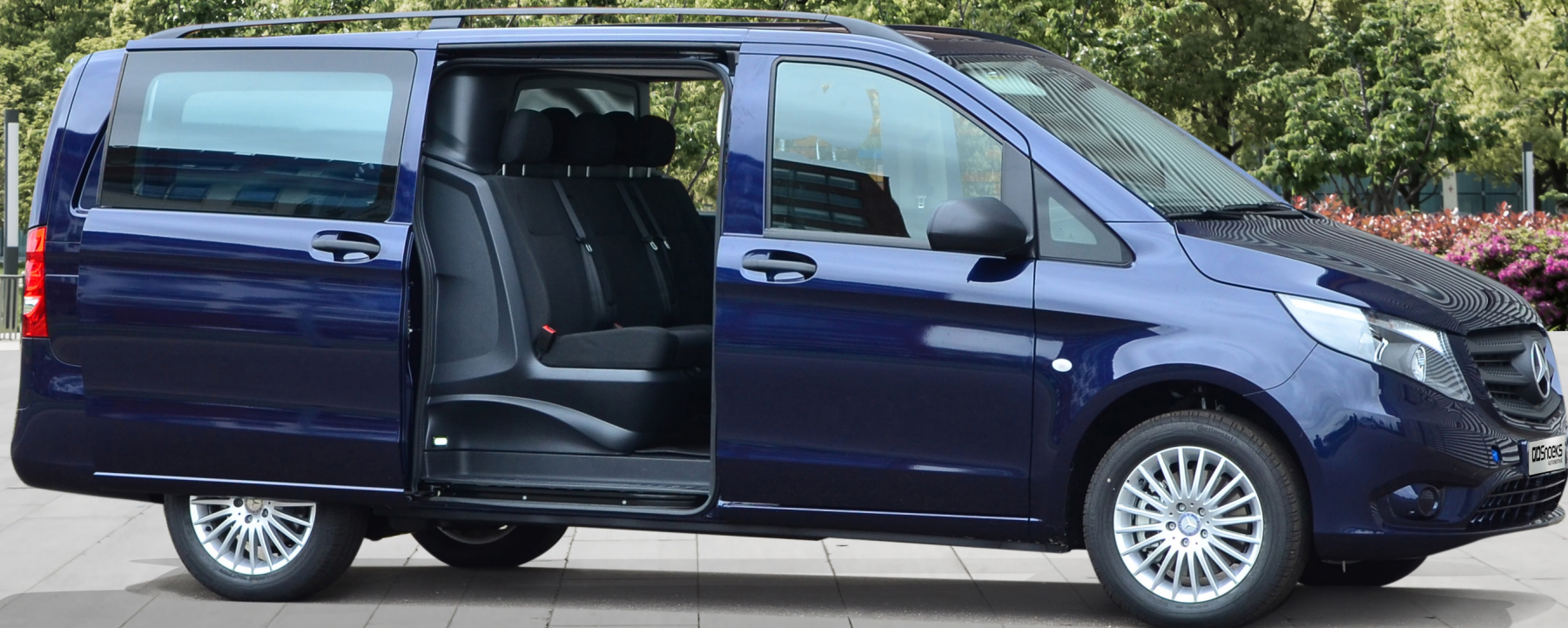
MERCEDES-BENZ VITO Crew Cab