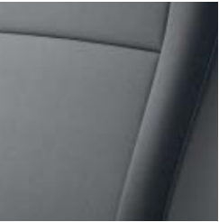
Kaleido black and grey fabric