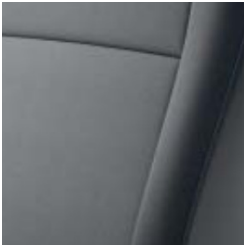
Black and dark carbon Kompo fabric