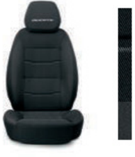
Crepe Black Fabric 076