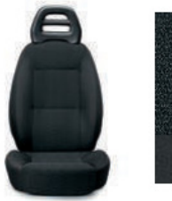
Crepe Black Fabric 173