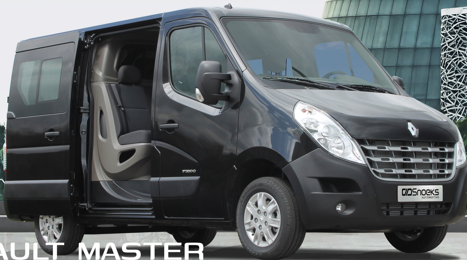
RENAULT MASTER Crew Cab