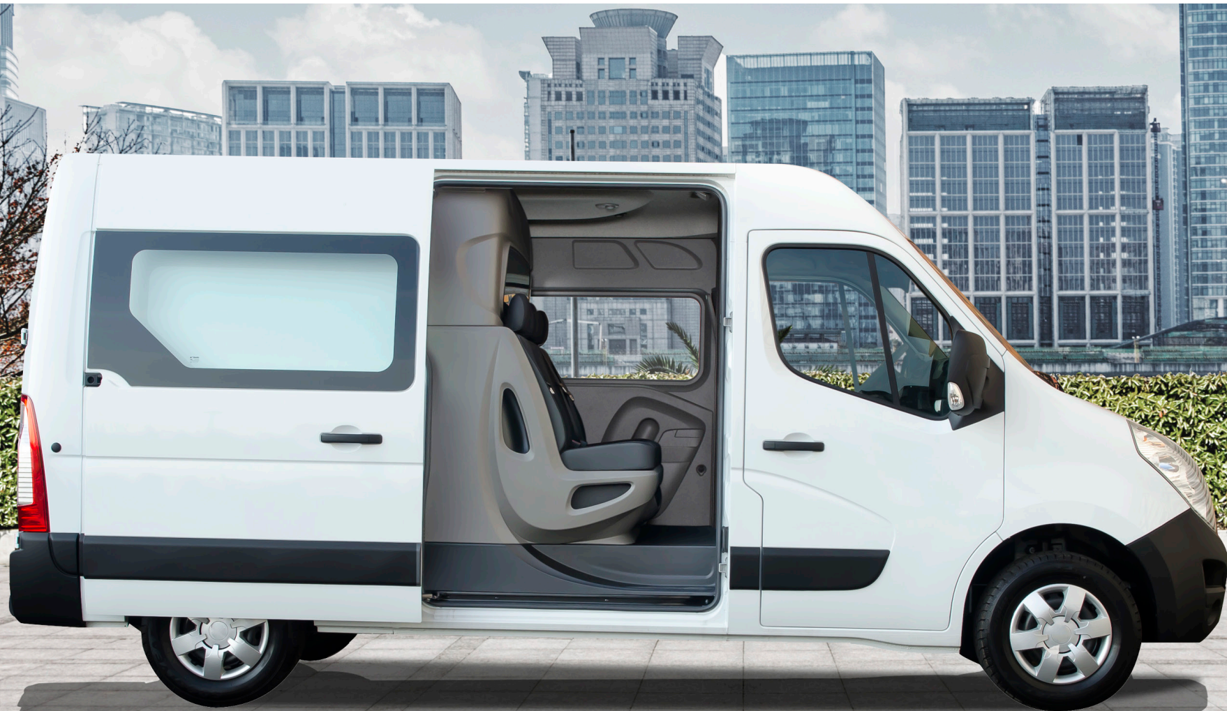
NISSAN INTERSTAR Crew Cab