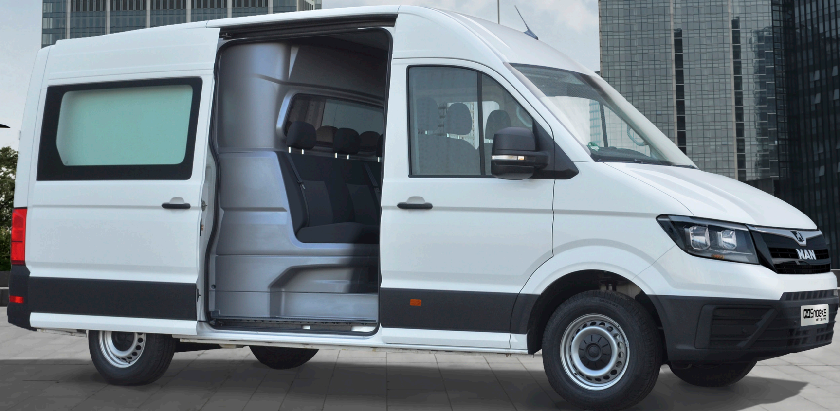
MAN TGE Crew Cab