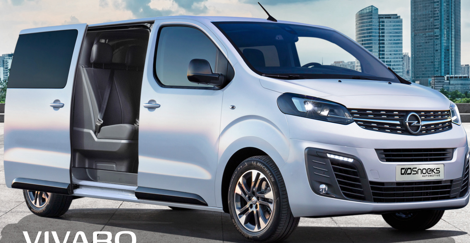
OPEL VIVARO Crew Cab