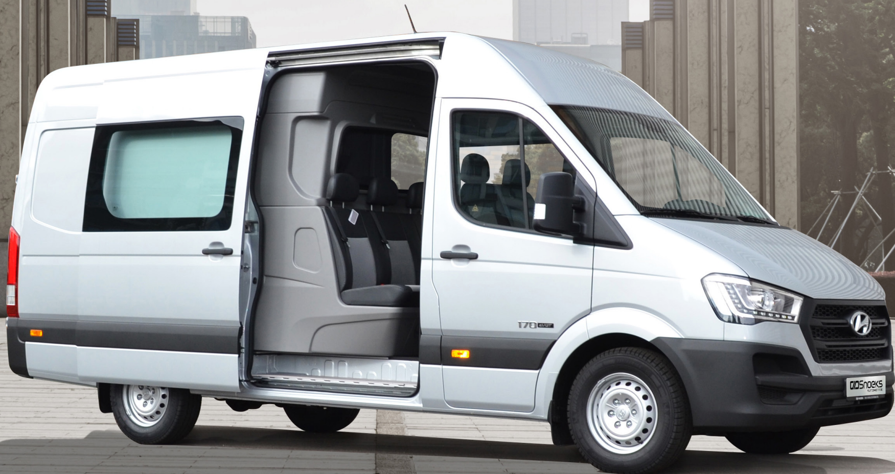
HYUNDAI H350 Crew Cab