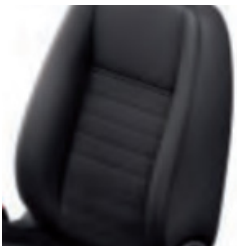
Ambiente & Trend