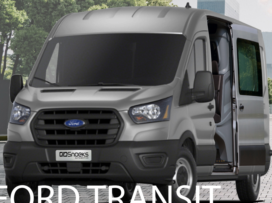
FORD TRANSIT Crew Cab