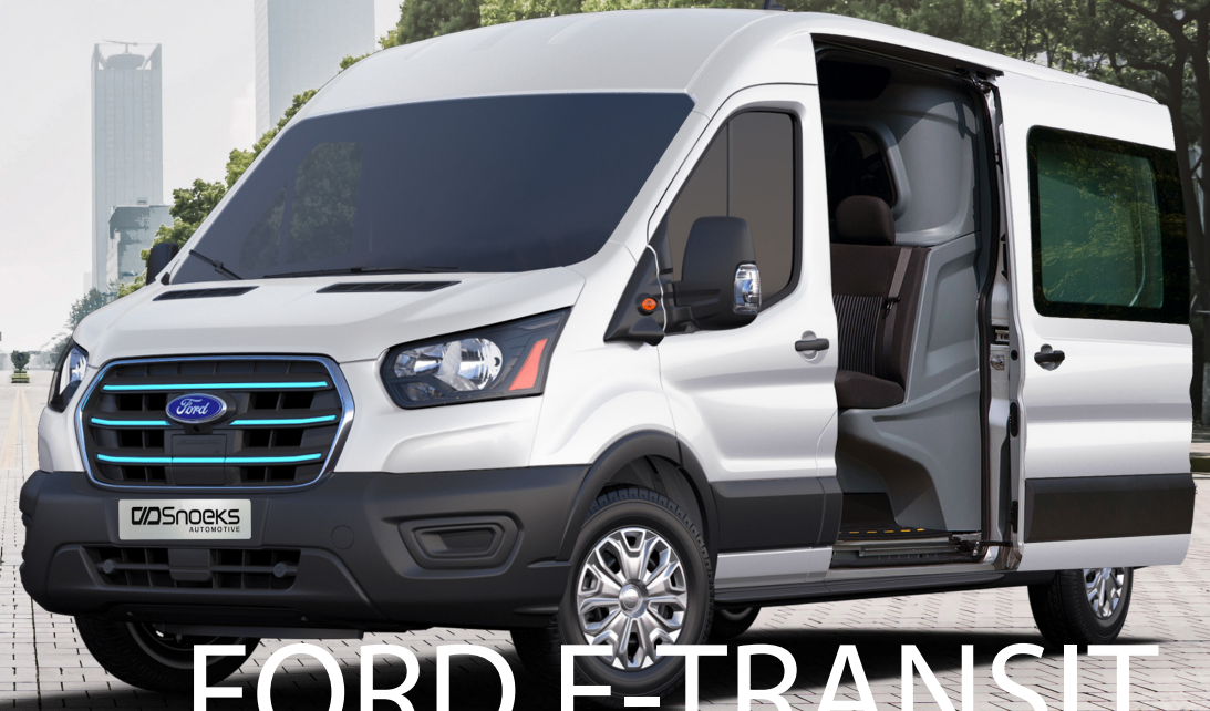
FORD E-TRANSIT Crew Cab