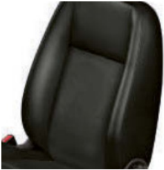
Trend & Limited